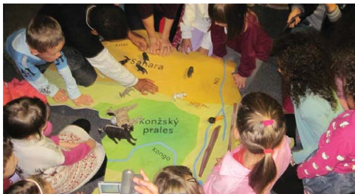
Colours of Africa