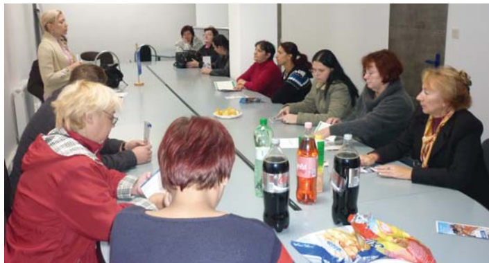
We are here for you