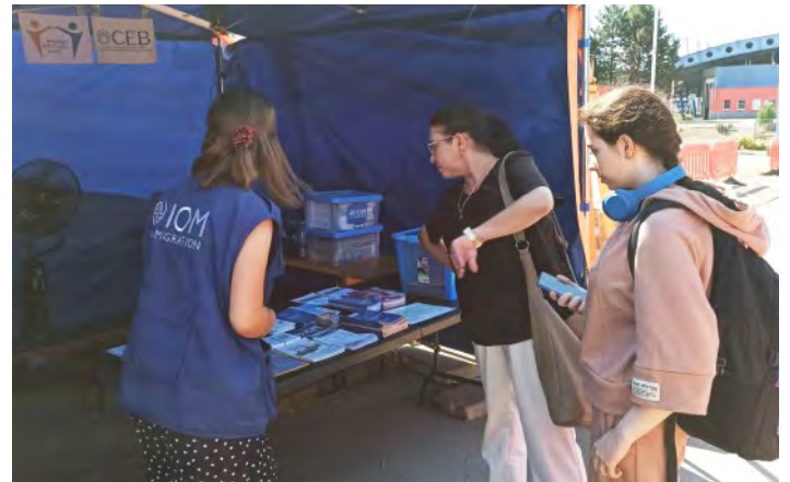
IOM CONSULTANT AT THE VYSNE NEMECKE BORDER POINT OF ENTRY PROVIDING COUNSELLING ON TRANSPORT AND TEMPORARY SHELTER IN SLOVAKIA FOR A MOTHER WITH A DAUGHTER FROM KHARKIV.

Source of data for the period of 24 February – 19 July 2022: IOM , UNHCR , Ministry of Interior of the Slovak Republic