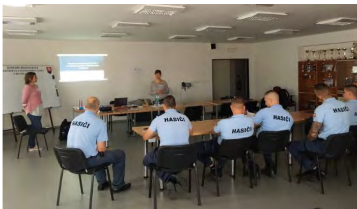
PARTICIPANTS OF PSEA TRAININGS FOR FIRE AND RESCUE SERVICE FOUND THESE TRAINING SESSIONS IMPORTANT AND USEFUL.

The trainings focused on raising awareness about human trafficking – most common myths, when, where and why it happens, how to recognize risky situations that occur at borders and what to do and where to turn if they meet a victim of human trafficking. The second part of the programme was dedicated to the PSEA topic: what is sexual exploitation, abuse and harassment and why it happens. They also learnt how to be vigilant and recognize signs of sexual exploitation and abuse, where to seek help and how to report cases when they encounter sexual exploitation or abuse.