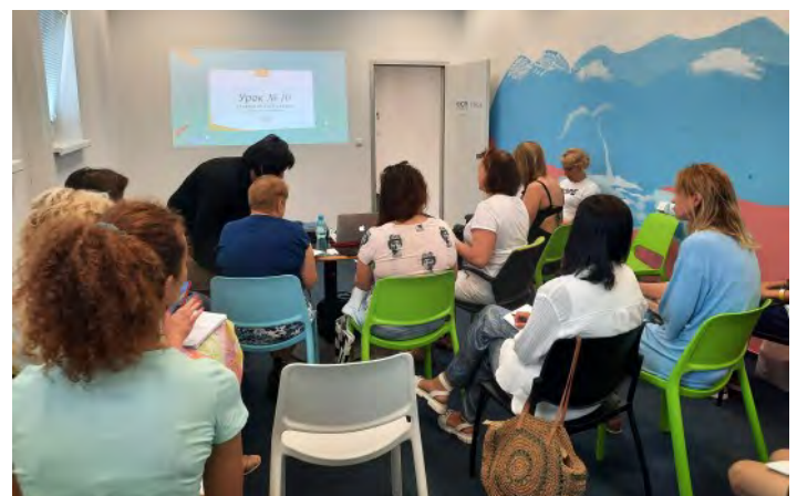
IOM COURSE OF SLOVAK LANGUAGE FOR PEOPLE FROM UKRAINE AT THE BOTTOVA ASSISTANCE CENTRE IN BRATISLAVA.

Participants of these courses improve their Slovak language skills which will accelerate their integration in the society, help them find a job and facilitate children's inclusion in the Slovak school system.