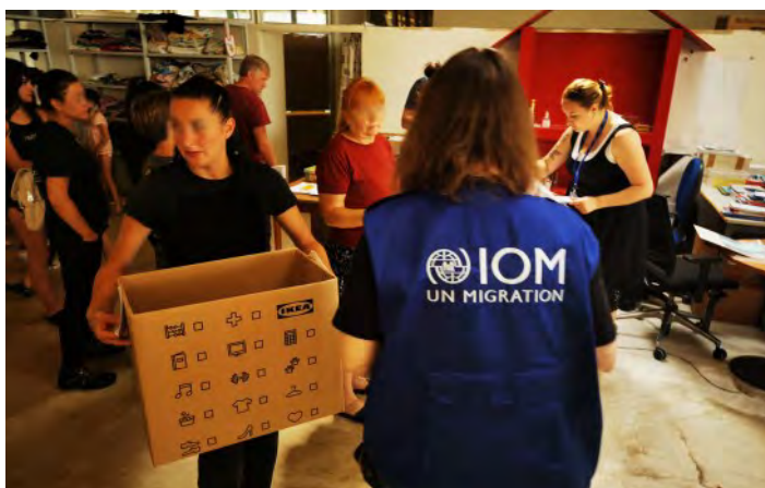
DISTRIBUTION OF KITCHEN SETS WITHIN THE IOM HUMANITARIAN AID DELIVERY AT THE GABCIKOVO ACCOMMODATION FACILITY.

Additionally, in mid-July IOM distributed 500 hygienic sets, separately for men, women and children.