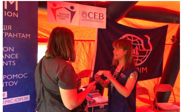
IOM SLOVAKIA AT UBLA BORDER POE ALSO RAISE AWARENESS OF UKRAINIANS ABOUT THE RISKS OF HUMAN TRAFFICKING AND DISSEMINATE CONTACT DETAILS FOR FURTHER QUESTIONS AND SITUATIONS THAT MAY ARISE DURING THEIR STAY IN SLOVAKIA.

Source of data for the period of 24 February – 12 July 2022: IOM , UNHCR , Ministry of Interior of the Slovak Republic