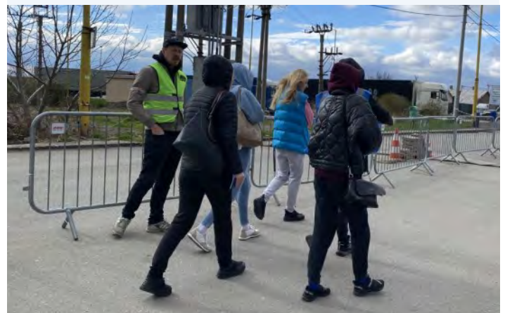
PEOPLE FLEEING WAR ARE CROSSING UKRAINIAN-SLOVAK BORDER AT THE VYSNE NEMECKE POE.

As the Displacement Tracking Matrix Focal Point in Slovakia, I supervise, coordinate and provide capacity building for our staff in the field collecting data on the mobility, needs and intentions of displaced people fleeing war. By analyzing data on the needs and intentions of people fleeing war in Ukraine, IOM can better understand how to best address its response in providing support and immediate assistance.