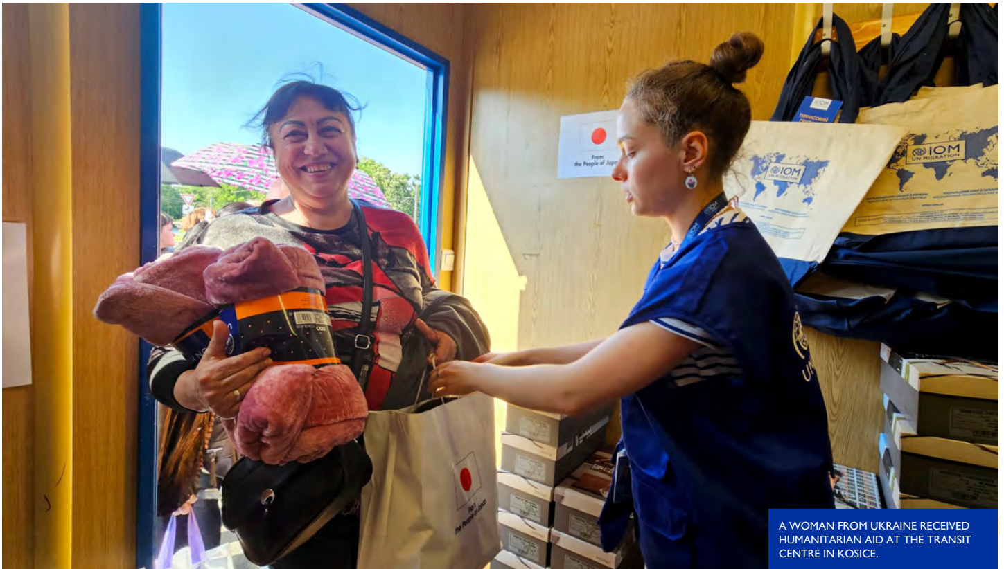
A WOMAN FROM UKRAINE RECEIVED HUMANITARIAN AID AT THE TRANSIT CENTRE IN KOSICE.