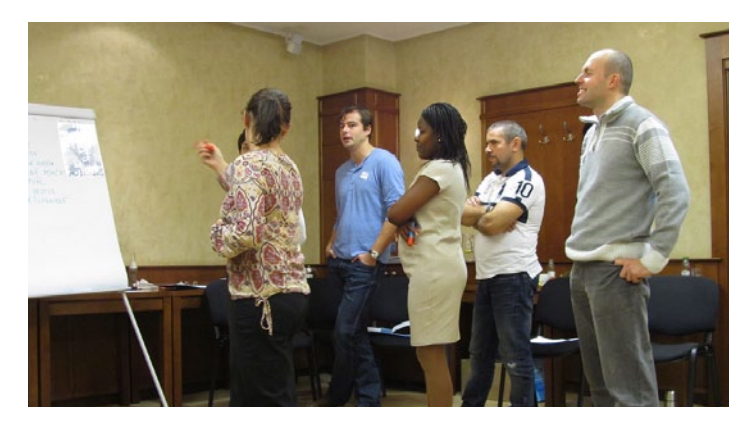
Representatives of migrant communities from Cameroon, Cuba and Vietnam shared their experiences of living and working in Slovakia with the training participants.

From October to December 2013, IOM organized two trainings in Piešťany and two workshops in Nitra and Trnava for 50 public administration representatives working with third-country nationals in Slovakia. The trainings, being the first part of the training programme, as well as the follow-up workshops focus on gaining skills in intercultural communication, knowledge in the field of migration, migrant integration and cooperation among the key institutions.