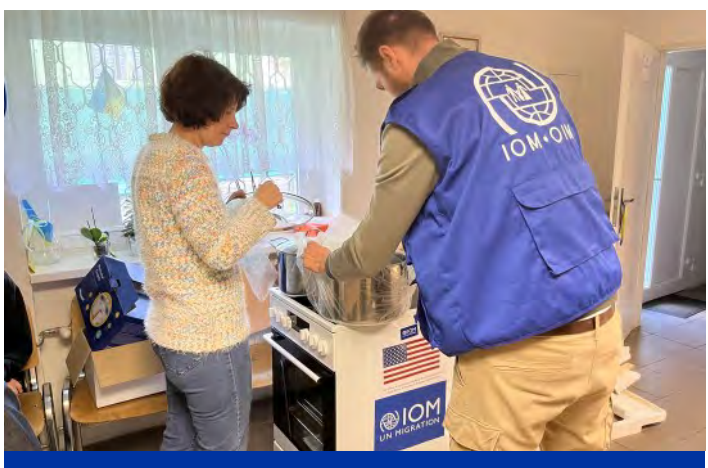
IOM HUMANITARIAN AID DELIVERY TO A COMMUNITY CENTRE IN RUZOMBEROK IN SEPTEMBER 2022

This centre serves as a community space for Ukrainian people in the Ruzomberok region, with a children's playground and study room for daily language courses and sessions to facilitate applying for and finding a job. At the same time, this centre operates as a distribution centre for food and hygiene humanitarian assistance.