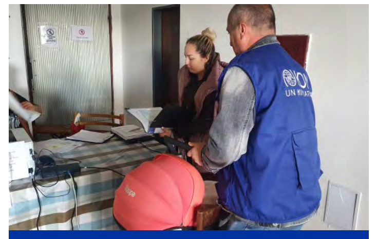
AN IOM CONSULTANT IS HANDING OVER A HYGIENIC KIT TO THE UKRAINIAN FAMILY FROM KHARKIV WHICH CAME TO THE MICHALOVCE REGISTRATION CENTRE TO APPLY FOR THE TEMPORARY REFUGE STATUS IN SLOVAKIA.

Source of data for the period of 24 February – 4 Oct. 2022: IOM, UNHCR, Ministry of Interior of the Slovak Republic.