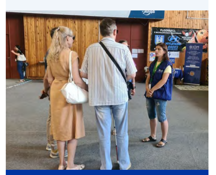
PEOPLE WITH VISUAL IMPAIRMENT TRAVELLING TO THE CZECH REPUBLIC CROSSED THE SLOVAK BORDER WITH THEIR DOMESTIC PASSPORTS. IOM CONSULTANT AT THE MICHALOVCE REGISTRATION CENTRE ADVISED THEM ABOUT A BORDER CROSSING CERTIFICATE, ISSUED IN BRATISLAVA, AND HELPED THEIR ASSISTANT ON THE TRAVEL INFORMATION.

Data collection on displacement, people's needs and intentions to better understand mobility dynamics in the region and strengthen the response to the crisis.