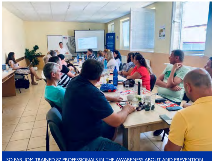
SO FAR, IOM TRAINED 87 PROFESSIONALS IN THE AWARENESS ABOUT AND PREVENTION OF HUMAN TRAFFICKING.

The professionals also learnt about the most common myths about human trafficking, how to recognize risky situations that occur at borders and how to support safe travel of people coming from Ukraine. Moreover, they were informed about what to do and where to turn if they meet a victim of human trafficking.