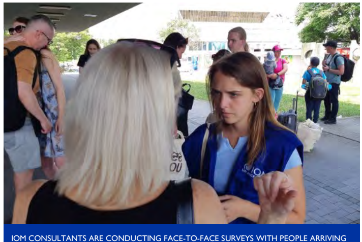
IOM CONSULTANTS ARE CONDUCTING <u>FACE-TO-FACE SURVEYS</u> WITH PEOPLE ARRIVING TO SLOVAKIA OR RETURNING TO UKRAINE ABOUT THEIR MOBILITY, NEEDS AND INTENTIONS. IT HELPS IOM TO RESPOND TO THE NEEDS OF CONFLICT-AFFECTED POPULATIONS.

Source of data for the period of 24 February – 28 June 2022: <u>IOM, UNHCR</u>, Ministry of Interior of the Slovak Republic