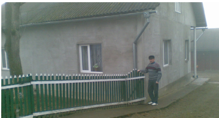
The house of the Ukrainian family from Velesniv before the reconstruction and after outer insulation and windows replacement.