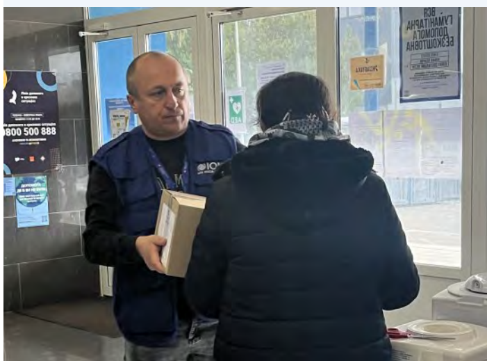
IN RESPONSE TO BASIC NEEDS OF WAR-AFFECTED PEOPLE ON THE RUN, AN IOM CONSULTANT AT THE MICHALOVCE REGISTRATION CENTRE DISTRIBUTES HYGIENIC KIT TO A WOMAN FROM MYKOLAIV WHO IS AFTER ARRIVING IN SLOVAKIA IN NEED OF FINANCIAL AND HUMANITARIAN SUPPORT.

Provision of emergency humanitarian aid to people in need in Ukraine and people fleeing Ukraine.