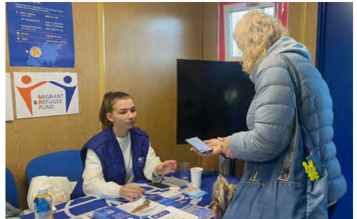
AN IOM CONSULTANT AT THE HOTSPOT IN THE RAILWAY STATION IN KOSICE PROVIDES DISPLACED PEOPLE FROM UKRAINE WITH VITAL INFORMATION AND LEGAL COUNSELLING.

Source of data for the period of 24 February – 6 Dec. 2022: IOM , UNHCR , Ministry of Interior of the Slovak Republic.