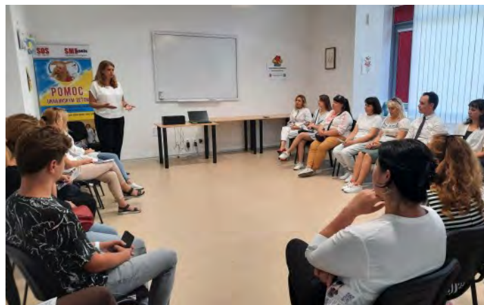
IN BRATISLAVA, PEOPLE ACQUIRED IMPORTANT INFORMATION ABOUT WHAT SERVICES, ASSISTANCE AND PROGRAMME OPPORTUNITIES PROVIDED BY IOM MIC AND THE CIVIC ASSOCIATION SME SPOLU THEY CAN BENEFIT FROM.

over 970 people that fled war in Ukraine, IOM made a great atmosphere and held workshops for children with face painting and bracelets making in the colours of the Ukrainian flag.