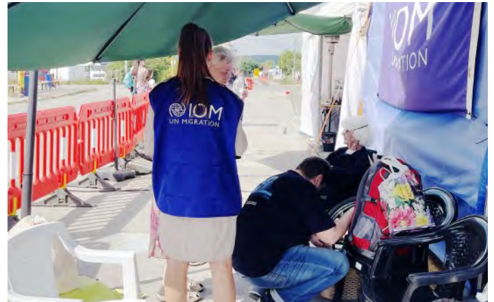
AN IOM CONSULTANT IS PROVIDING A FAMILY FROM KHARKIV CARING FOR A DISABLED PERSON WITH INFORMATION WHILE THEY ARE WAITING FOR A SPECIAL TRANSPORT TO THE MICHALOVCE REGISTRATION CENTRE.

Source of data for the period of 24 February – 6 Sept. 2022: IOM , UNHCR , Ministry of Interior of the Slovak Republic.