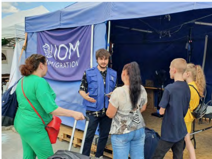
AN IOM CONSULTANT AT THE VYŠNÉ NEMEČKÉ POE INFORMS PEOPLE FROM ODESSA ON THE OPTIONS HOW TO GET TO GERMANY AND HOW TO GET SLOVAK HELP CARDS FOR FREE TRANSPORTATION IN SLOVAKIA.

Direct assistance and response to immediate refugee needs at border points of entry and dedicated registration centres.