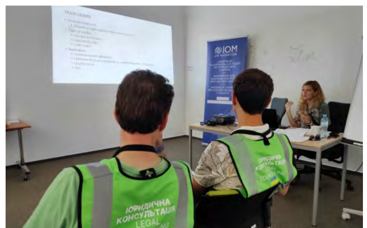
IOM TRAINING FOR LAWYERS FROM THE HUMAN RIGHTS LEAGUE ABOUT RESIDENCE OF FOREIGNERS IN SLOVAKIA.