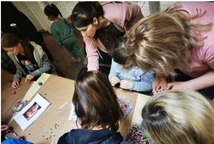
EASTER CELEBRATION IN THE UKRAINIAN TRADITION AT THE GABCIKOVO ACCOMMODATION FACILITY.

During the day that began with a Holy Mass children searched for Easter eggs, they sang and danced. As part of a colourful programme, they participated in other creative activities such as face painting, beads stringing or handicrafts. To preserve the Easter spirit in the following days, they received Easter packages prepared by a local grammar school.