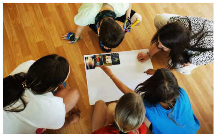
AT THE GABCIKOVO ACCOMMODATION FACILITY, 37 YOUNG PEOPLE LEARNT ABOUT THE PREVENTION OF SEXUAL ABUSE AND EXPLOITATION.

The teenagers appreciated the interactivity of the workshops and experience-based learning.