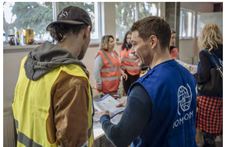
IOM PROVIDES COUNSELLING, BUILDS CAPACITIES OF PROFESSIONALS AND DISSEMINATES INFORMATION LEAFLETS AND INFORMATION CARDS WITH RELEVANT PREVENTIVE INFORMATION AND CONTACT DETAILS TO REDUCE THE RISK OF HUMAN TRAFFICKING.

The Task Force aims at sharing information and evidence on risks of trafficking among the population fleeing Ukraine. It supports effective and coordinated action of partners involved in prevention and addressing human trafficking. Its objective is also to provide practical recommendations and advice at the operational level. The Task Force will continue meeting monthly.