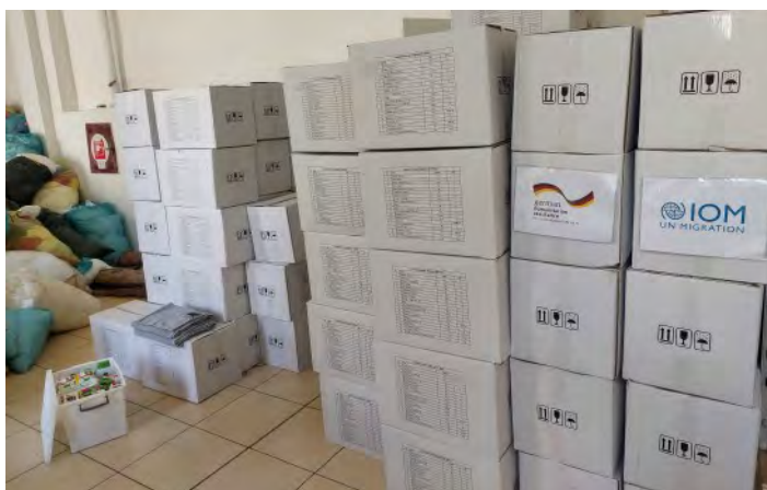
IOM DELIVERED HYGIENIC KITS TO THE MICHALOVCE REGISTRATION CENTRE, WITH THE FINANCIAL SUPPORT FROM THE GERMAN FEDERAL FOREIGN OFFICE.

The kits consisted of bucket, comb, sponges, nail clipper, laundry detergent, laundry line, toothpastes, toothbrushes, towels, mug, jug, razors, sanitary pads, shampoo, shaving cream, soaps and dishwashing liquid.